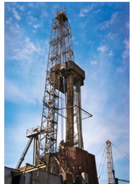
MeshGuard wireless gas detectors are designed for use in the harshest outdoor environments such as drilling rigs and in other industrial applications