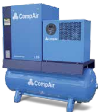
Complete airstation including compressor, dryer and receiver